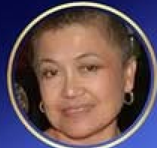
LIBERTY BANCOD 2nd Vice President