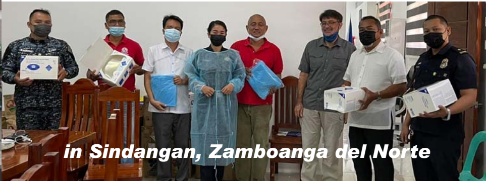
in Sindangan, Zamboanga del Norte