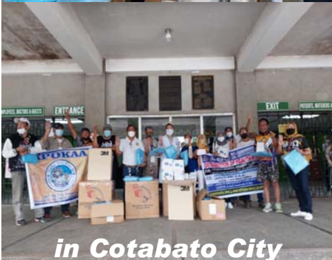
in Cotabato City